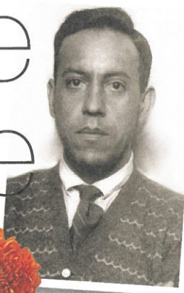
Fr Miguel Pro SJ died, aged thirty-six, on 23 November 1927, one of twenty-five beatified martyrs of Mexico's Cristero War.