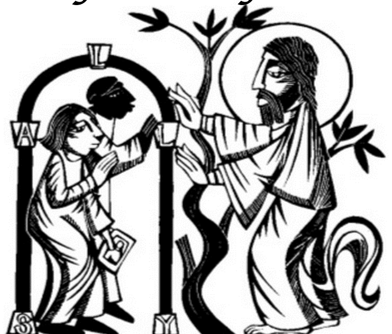
'Baptise them in the name of the Father and of the Son and of the Holy Spirit ... and know that I am with you always; yes, to the end of time' (Matthew 28:19-20)

This weekend there is the Monthly Special Collection at St John's for the St John's Tower Fund...and next Sunday the delayed Annual Collection for the Day for Life (always celebrated on the Feast of the Visitation on 31 May).