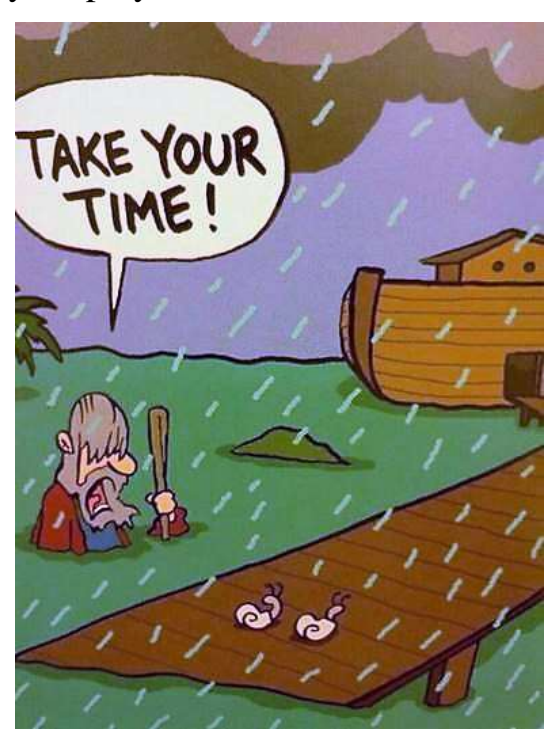
Thanks to the PJPC e-newsletter

SPUC will be grateful for any donation you can give and asks that you remember their work in your prayers.'